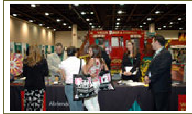
2008 Expo Open to Public