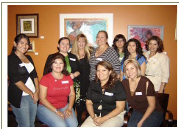
New Mujer, Inc. members

"I believe that my art has an opportunity to make a statement that I have a passion for. Some of my work is about domestic violence." As a counselor, I see first hand the damage and pain that occurs to children when their parent is being physically or verbally abused. Research shows us that a child's brain is actually altered as they view this abuse. We also know that girls growing up in an abusive home are far more likely to choose an abusive partner when they become an adult. Some of my work is also about children, I see the effects that a parent has on a child when they promise them over